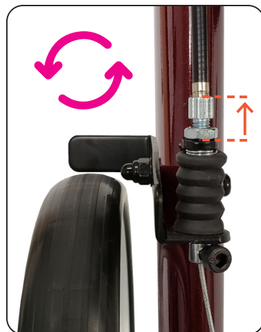
Tighten the Brake