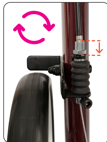
Loosen the Brake